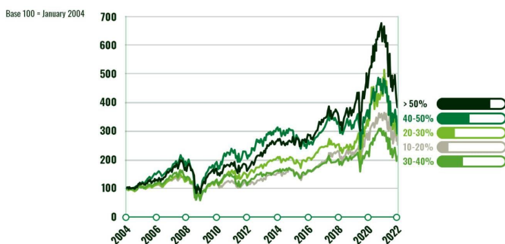
The stock performance according to the share of the company held by the same family

Looking again at the period from January 2004 to October 2022, the stocks of businesses that are more than 50%-owned by the founding family post much higher gains than companies with lower family stakes. This is largely due to better alignment between the interests of shareholders and management. Such majority-owned businesses are also less subject to the demands of minority shareholders whose interests may not be consistent with those of management and/or the company's long-term goals.